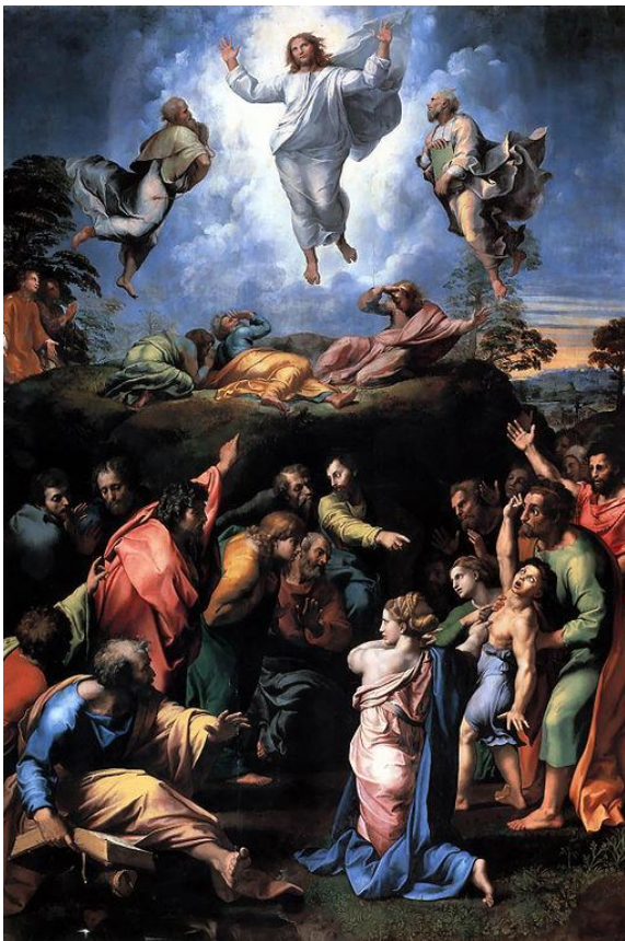
FIGURE 4: RAPHAEL 'THE TRANSFIGURATION'