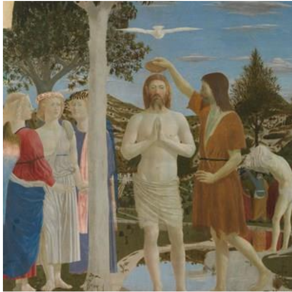
FIGURE 2: PIERO DELLA FRANCESCA 'THE BAPTISM OF CHRIST'