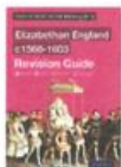
Elizabethan England c1568–1603 Revision Guide: 978 019 842293 8