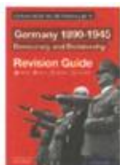
Germany 1890–1945 Democracy and Dictatorship Revision Guide: 978 019 842289 1