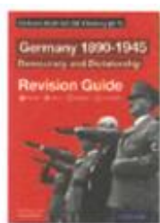
Germany 1890–1945 Democracy and Dictatorship Revision Guide: 978 019 842289 1