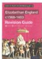
Elizabethan England c1568–1603 Revision Guide: 978 019 842293 8