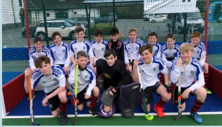
U14 Boys' Hockey team at the East of England finals