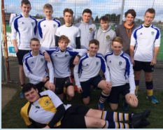
Senior Boys' win the East Preliminary Tournament.

Two very tough games for the U15 A & B Netball teams. Both teams lost to Forest 11 - 18, then they both fought back to win their matches against Bishops Stortford College. A Team 19 - 18 and the B team 26 - 15. Well played Girls!