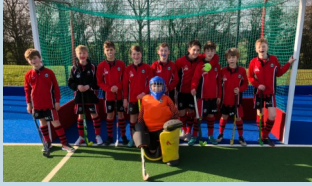
Year 7 at the Cambs U12 Hockey Tournament

Half Term Trips: A total of 151 students and 15 staff travelled to Italy for the Lower School Ski Trip during half term.