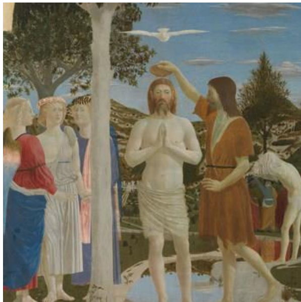
FIGURE 2: PIERO DELLA FRANCESCA 'THE BAPTISM OF CHRIST'