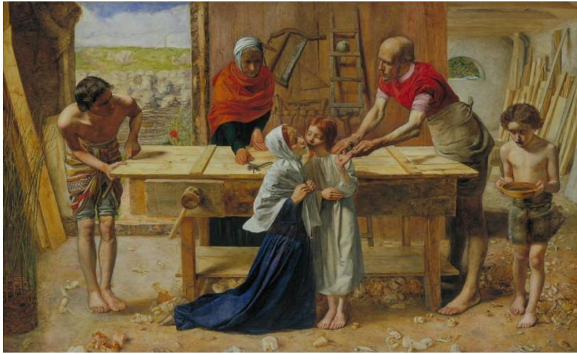
FIGURE 1: JOHN EVERETT MILLAIS 'JESUS OF NAZARETH'