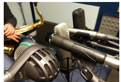
Testing microphone response with Y12

You could start researching microphones and learning more about the different operating principles, polar patterns and the use of specific models. Start by researching some of the models in our mic cupboard, including the Shure SM57, Rode NT1-A, Rode NT-5 and AKG D112.