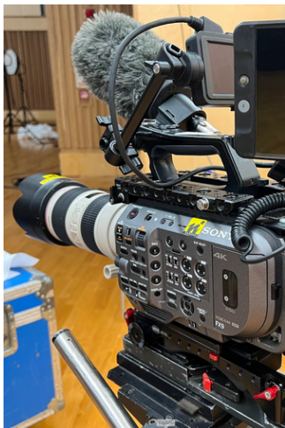
BBC TV recording at Saffron Hall, July 2022. Close links with the hall mean lots of opportunities for performing and work experience.