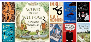
Just a few of the books that students and staff have been chatting about together on our SWCHS online Book Group

The SWCHS online Book Group is open to all students and staff at SWCHS. The members enjoy coming together and sharing recommendations, thoughts and opinions on what we are all reading while we are at home. This group is here for anyone at all who would like to connect at this time. There are no tasks to complete, or deadlines to be met, participants don't even have to contribute if they don't want to.