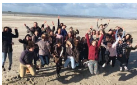
Year 8 students enjoying the beach in France