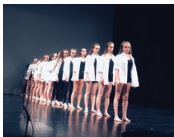
SpringBlast Dance Platform