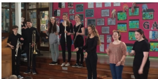
Music Academy students performing at RAB