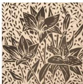
Lottie Beckett Year 13