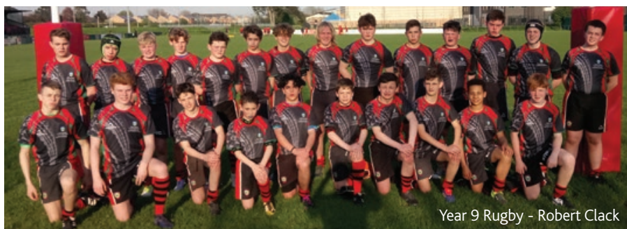
Year 9 Rugby - Robert Clack