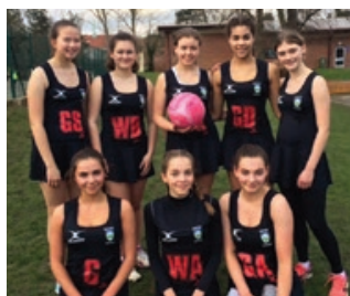
Year 9 A team