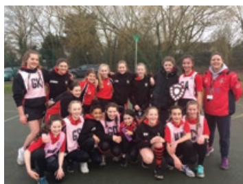
Year 7 - District Netball Champions