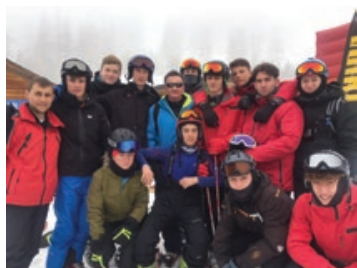
Year 11 students in Italy