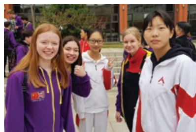
Spending time at our partner school in Beijing