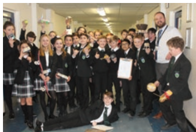
Year 7 with their Egg Race Mobiles