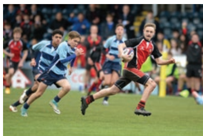
England RFU National Schools U15 Bowl