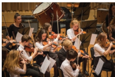
Students performing in the Winter Concert