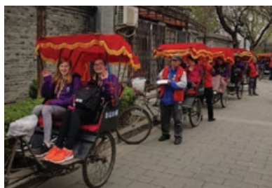
Students enjoying a Rickshaw trip.