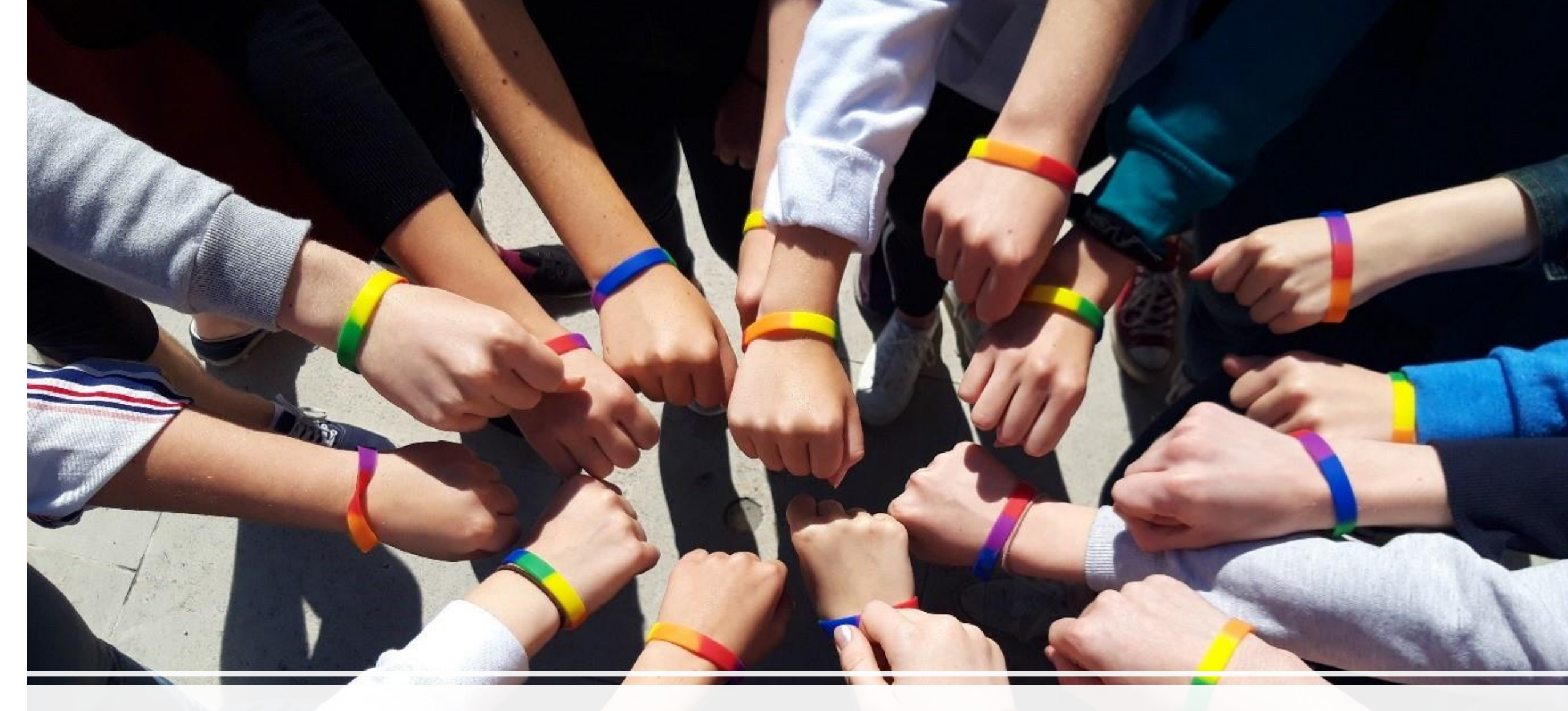
Induction Week: Monday 3rd July – Wednesday 5th July