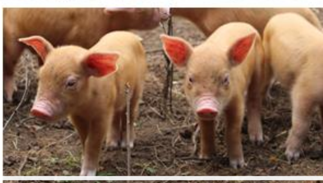
Not an Ordinary School